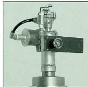
AIR POWER UNIT