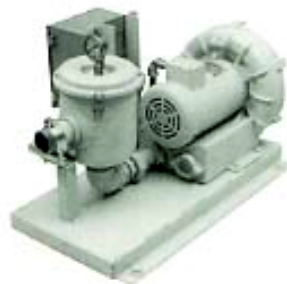
ROTRON BLOWER UNIT