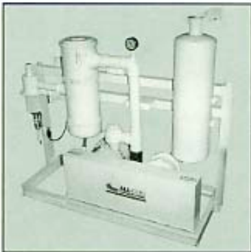
VACUUM POWER UNIT

ALL-CON will make your next Vacuum system!