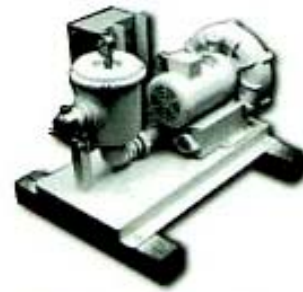
ROTRON BLOWER UNIT