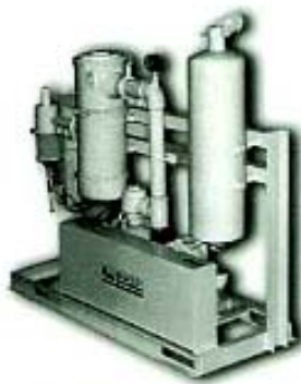
VACUUM POWER UNIT

The ALL-CON MVC-24 is a completely modular automatic self-cleaning chamber designed to grow or change as your production requirements dictate. No longer are you stuck with outdated equipment as your powdered material characteristics change! Simply reassemble the MVC-24 with a different center section, or change filters from a simple cartridge to a filter bag, or a pancake-type filter membrane. If expandability, ease of use and quality construction are your criteria, the choice is simple... ALL-CON will make your next Vacuum system!